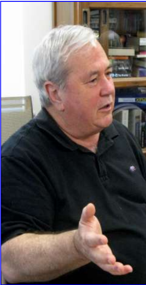
Chair of the TC, bestowing a benediction on the accompanying article

Bridge is a wonderful game that has given the bridge playing community countless hours of pleasure and challenge. It is a social game. A game that is competitive (in the best sense of the word). It can be played at a high level regardless of age. Bridge has become an international language and is one of the few games played today by people of all ages, races, and nationalities — truly a game for all seasons!