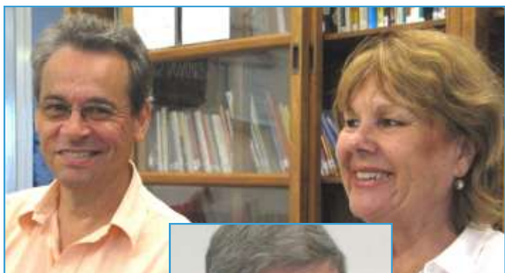
Committee at work.