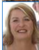
Printing and Records