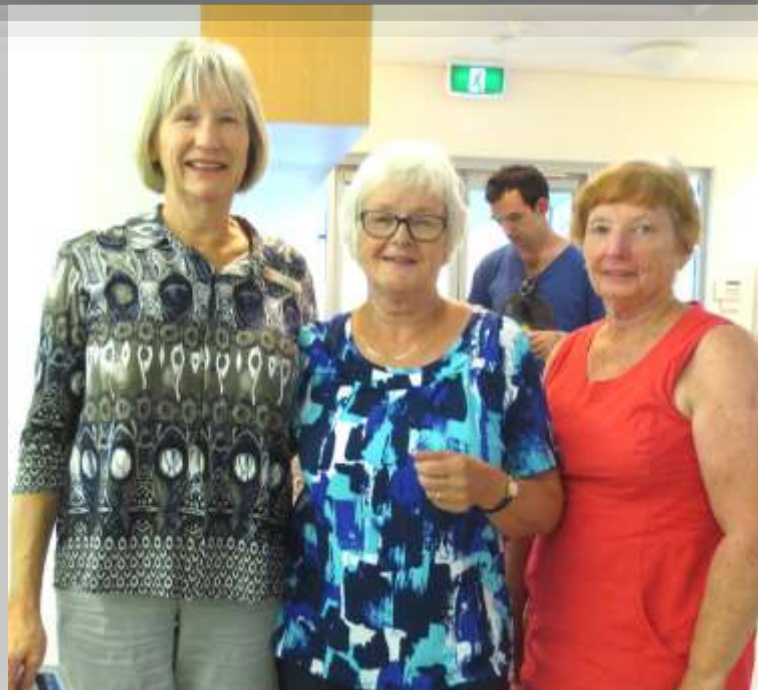
Third Place :