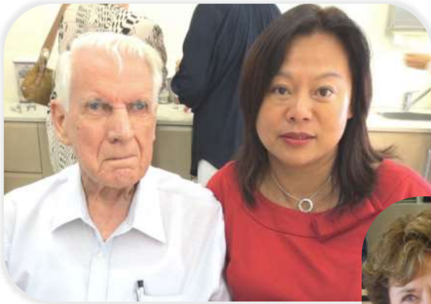
FIRST NORTH SOUTH