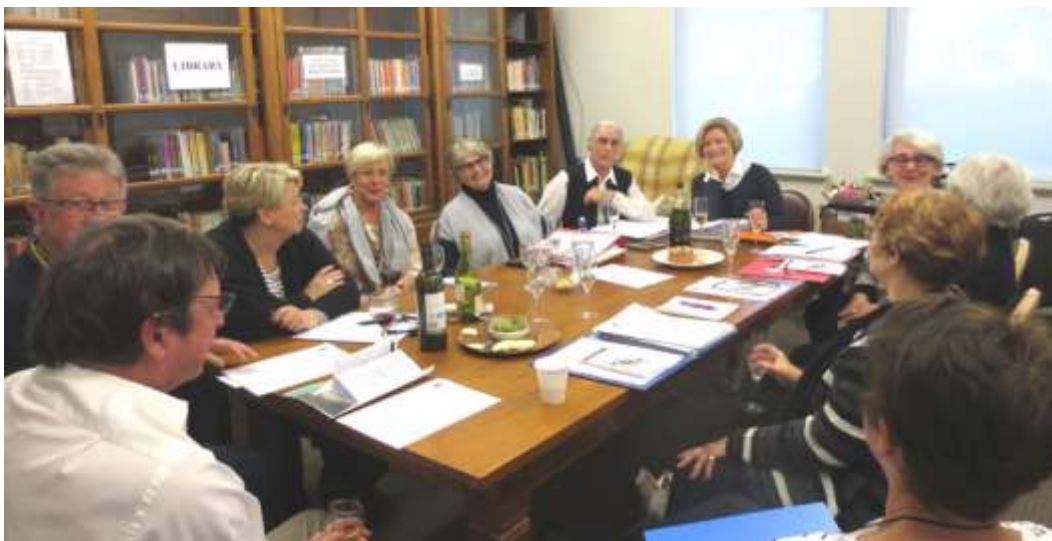
The last meeting of the 2014-15 committee.

Don't forget however that if you feel that you may be disadvantaged by the late arrival of players to your table you should promptly notify the Director. This will assist him to fairly judge the awarding of result percentage should you be unable to play a board or be otherwise disadvantaged. This is not carping but rather assisting the director to run a fair and equitable contest for every player in your movement.