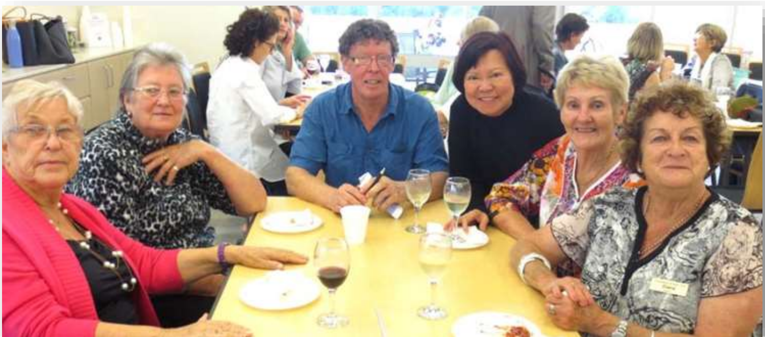
Enjoying the Resticted Swiss Congress day!

My lesson, be alert and concentrate right from the first board.