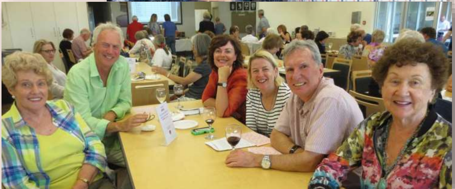
But all the contestants had a great time.!